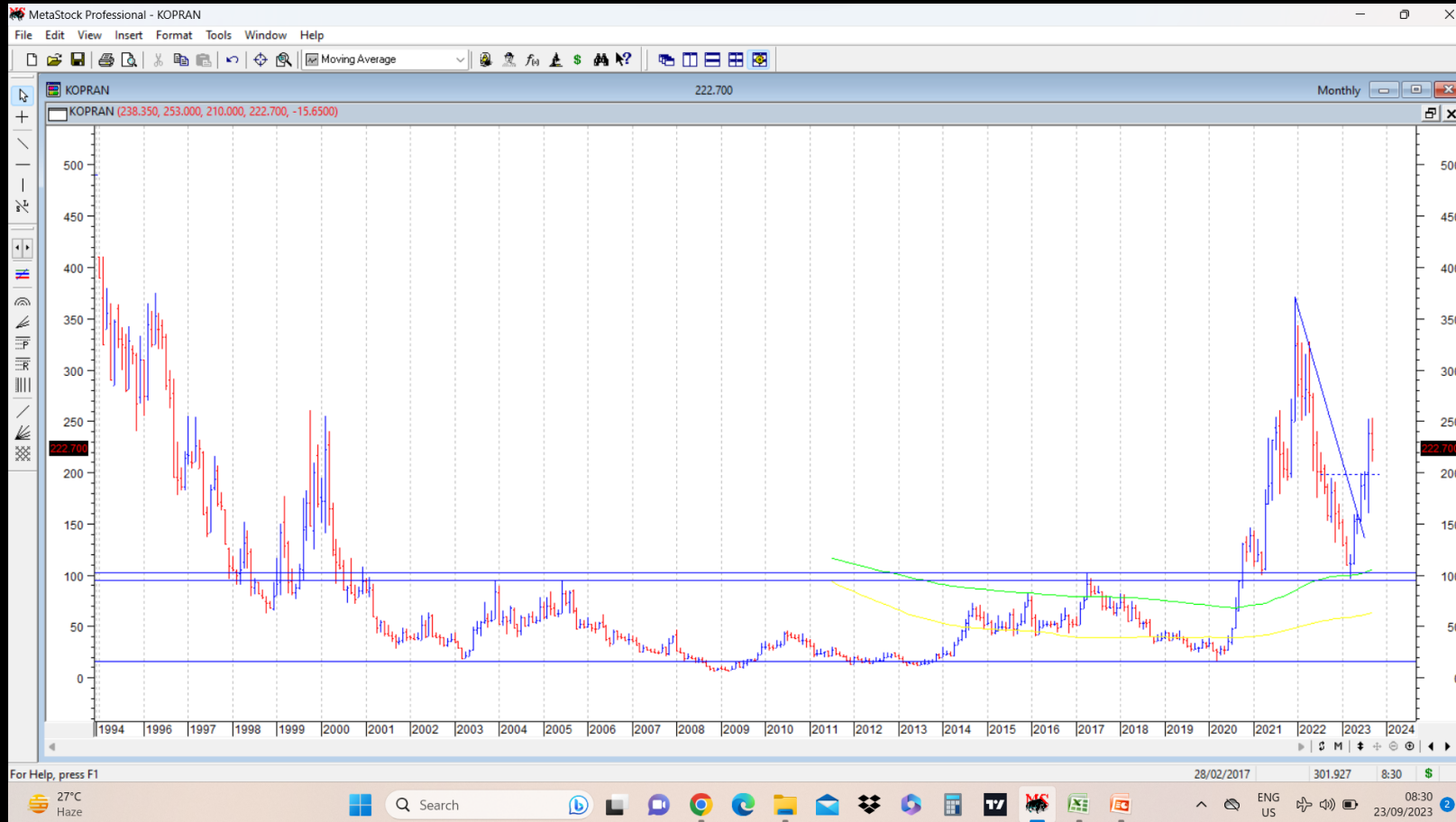
CHART EXAMPLE KOPRAN