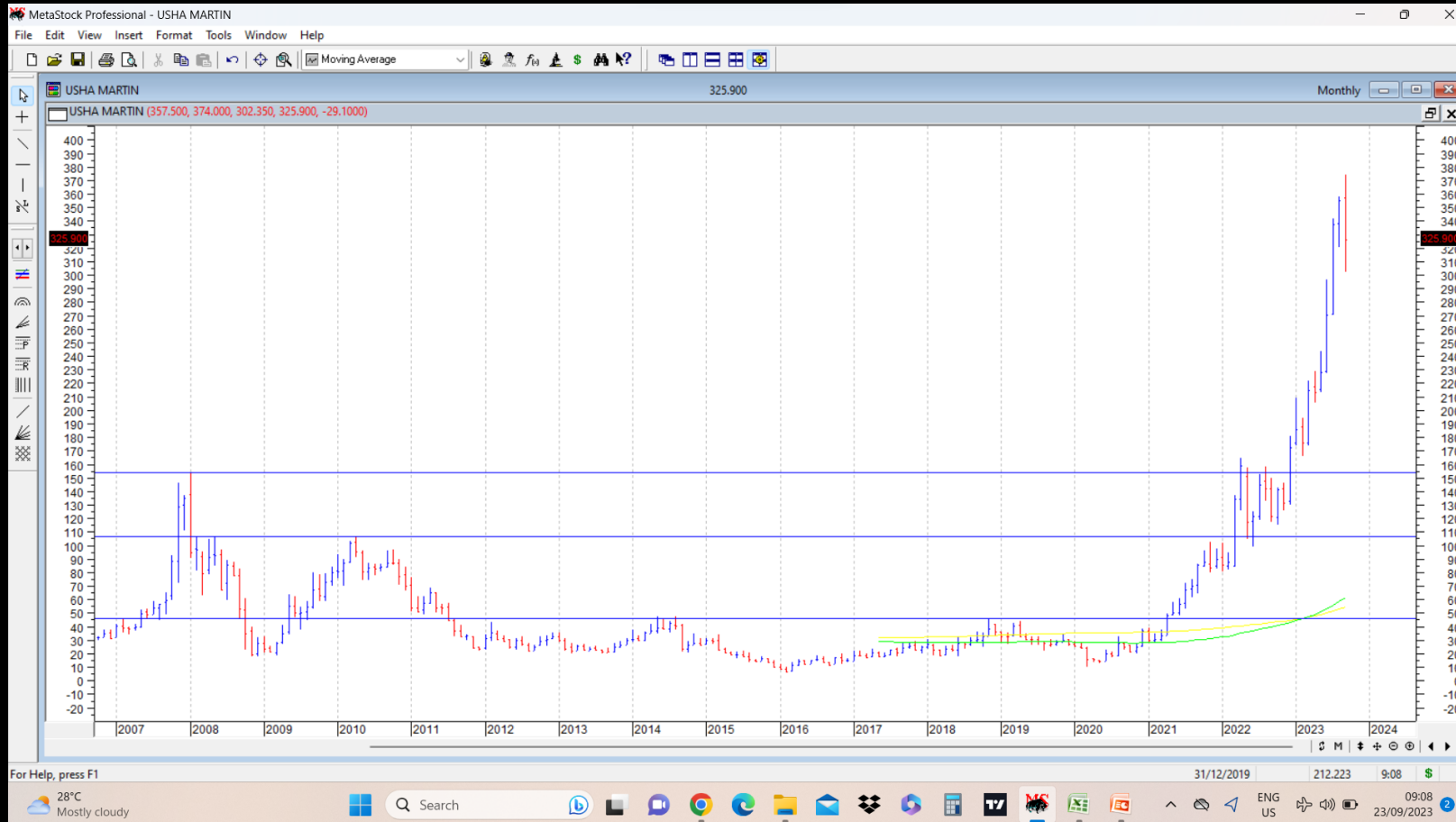
CHART EXAMPLE USHA